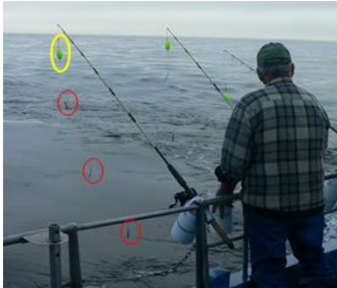
Photo of longleader gear ready to be deployed.