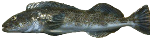
Lingcod ( Min. size 22 inches )

25 fish flatfish bag limit; Except for Pacific halibut