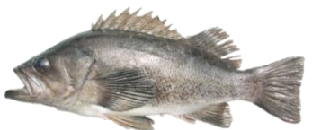
6 Black Rockfish

Out of the 7 marine fish bag limit, no more than: