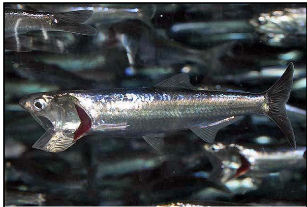
Northern anchovies generally move offshore in winter and return nearshore, including bays and estuaries, in the spring, summer and fall. There is speculation that the populations of northern anchovies and Pacific sardine are two forage fish with an inverse relationship determined by large-scale, naturally occurring temperature variations. Anchovies frequently seem to be yawning. The mouth is opened wide to help strain tiny plant and animal plankton from the water.