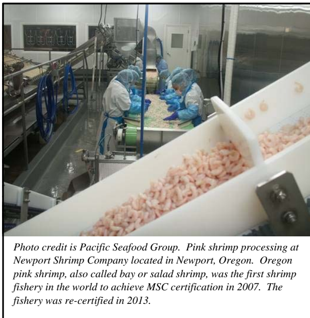
Pink shrimp processing at Newport Shrimp Company located in Newport, Oregon. Oregon pink shrimp, also called bay or salad shrimp, was the first shrimp fishery in the world to achieve MSC certification in 2007. The fishery was re-certified in 2013.

Oregon onshore landings from harvests in the Pacific Ocean and Columbia River catch areas are processed into seafood products that are sold locally or are shipped to high volume processing and distribution centers. The seafood products enter niche or commodity markets, both domestic