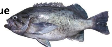
Deacon & Blue Rockfish = 3 fish combined