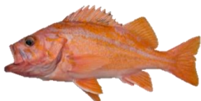
Canary Rockfish = 1