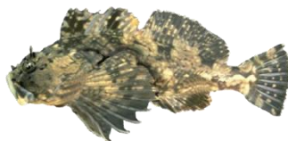
Cabezon = 1 July 1- Dec 31; Prohibited Jan 1-June 30 (Min. size = 16 inches)