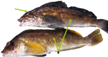
Kelp Greenling (Min. size = 10 inches)