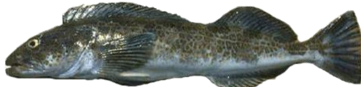
Lingcod (Min. size = 22 inches)