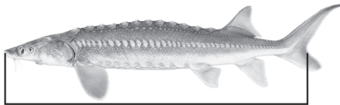
NEW Method "FORK LENGTH"

Measured from tip of snout to fork of tail with the fish on its side, on a flat surface and the tail in a natural position.