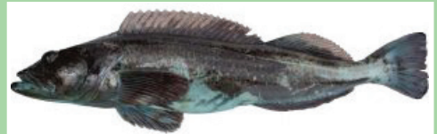
Min. size = 22 inches