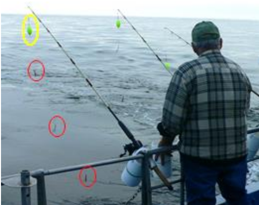
Photo of longleader gear