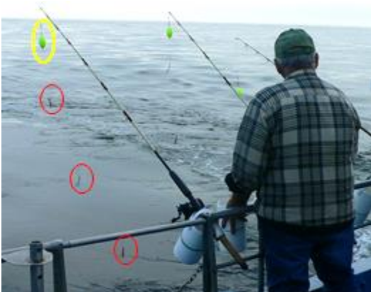
Photo of longleader gear