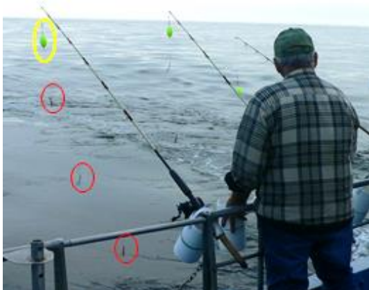
Photo of longleader gear