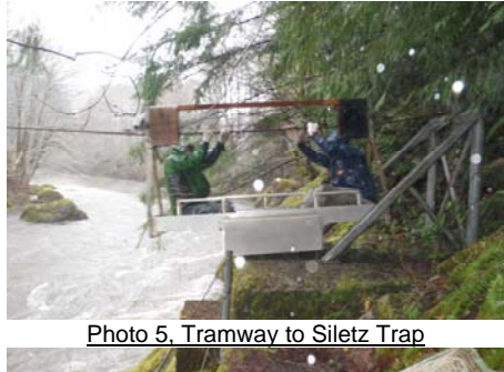
Photo 5. Tramway to Siletz Trap

Volunteers were extensively involved in fish population monitoring at fish traps at Schooner Creek and Siletz Falls in the Siletz Basin, as well as at Bohannon fish trap on Drift Creek in the Alsea Basin. The volunteers were also instrumental in conducting trap maintenance projects throughout the season. These trap operations are essential to district fisheries management and almost 1,500 hours were donated by over 20 volunteers in assisting with these fish monitoring activities.