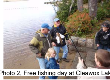
Photo 2. Free fishing day at Cleawox Lake

Volunteers helped to implement successful Youth Angling events at three sites on the Mid-Coast: Big Creek Reservoir, Eckman Lake and Cleawox Lake. Over 750 youth and their parents participated in the events. STEP biologists also supported the great work done by volunteer instructors for the YEAP by assisting with classes such as fish ecology, angler ethics and habitat restoration.