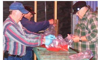
Photo 10. working up eggs in the Munsel Ck. hatchery

The local STEP biologist provided coordination, technical support and assistance to over 100 volunteers from the Florence STEP Group and the Emerald Empire Chapter of the Association of the NW Steelheaders in the operation of the Siuslaw River winter steelhead hatchery program. The volunteers operate adult capture facilities, spawn fish and rear eggs to the eyed stage. They are also involved in the acclimation of steelhead smolts before release. Trapping, early rearing and acclimation sites are located at Whittaker Creek, Green Creek, Munsel Creek and Letz Creek. In addition, the volunteers also operate a small educational propagation program in which they capture, spawn and rear Coho salmon to the unfed fry stage.