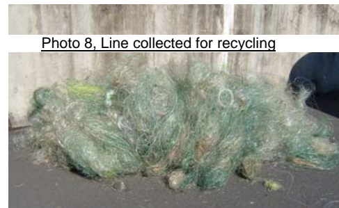
Photo 8, Line collected for recycling

Volunteers collected over 147 pounds of monofilament in the five years since the Monofilament Recycling Program started in 2004. Not only does the project improve the looks of the riparian habitat, it saves birds and small wildlife from becoming entangled. This year's total, 19 pounds is similar to the last three years. Previous year's weights of