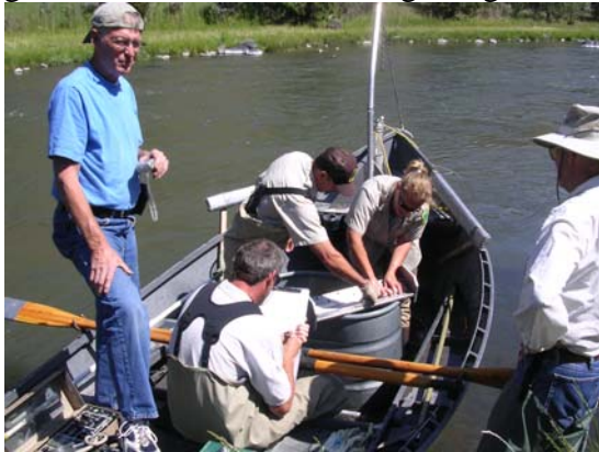
Photo 7. Tagging fish on the Crooked River

A partnership between OSU, ODFW and STEP has led to a study to learn more about redband and whitefish populations in Crooked River tailwater. STEP volunteers assisted an OSU graduate student monitor migrating behavior of redband trout and whitefish in the Crooked