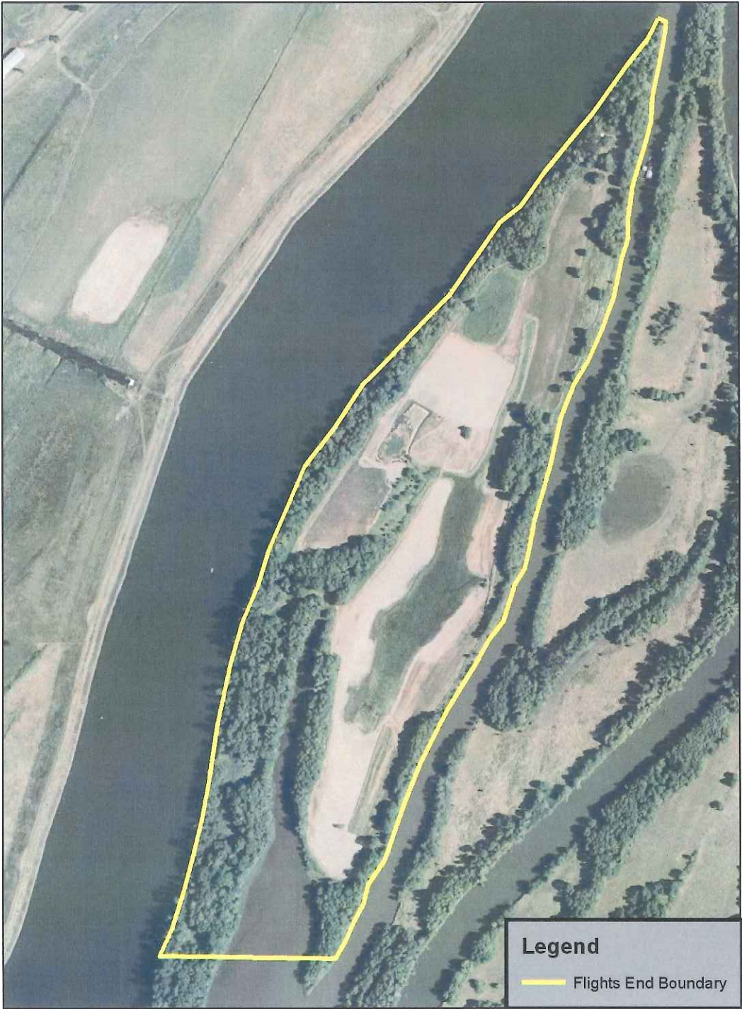
Exhibit 1. Aerial photo/map of Flight's End property. Property outlined in yellow; Multnomah channel is to the left.