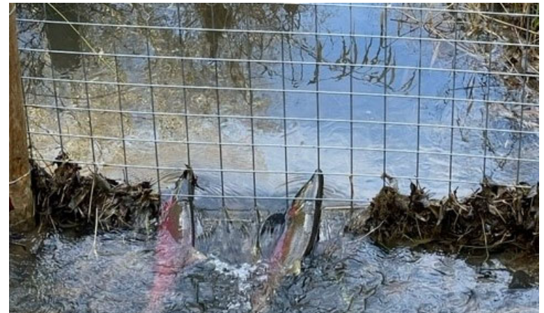
Beaver exclusion devices can be lethal to fish.