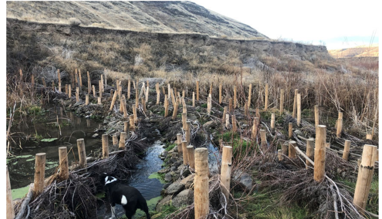
Low-impact, process-based restoration may not be either.