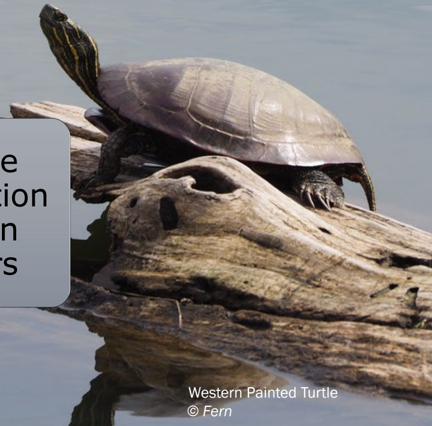
Western Painted Turtle © Fern