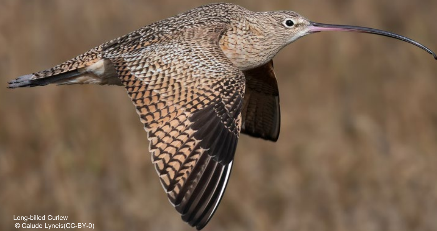
Long-billed Curlew