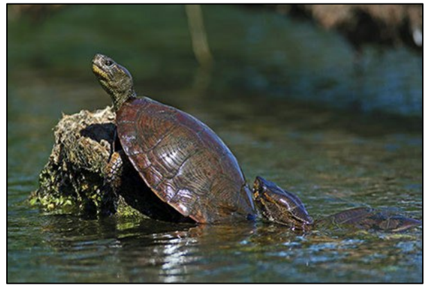
Northwestern Pond Turtle

ODFW acquired the 309-acre South Coyote and 224-acre Northeast Coyote units in 2013 and 2015, respectively. More recently, ODFW acquired the 100-acre South Coyote III (2022) and 40-acre South Coyote II (2024) properties. ODFW manages the overall 5,261-acre wildlife area under a 25-year agreement with the US Army Corps of Engineers, which owns and operates Fern Ridge Reservoir.