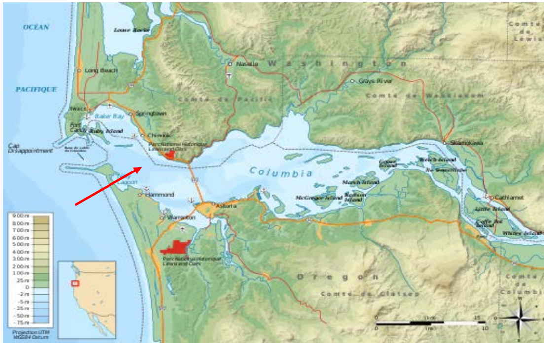
Figure 1. Map of Lower Columbia showing state boundary line.