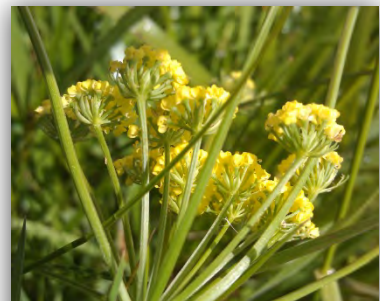
Bradshaw's lomatium.

ODFW is currently developing a management plan specific to the property that will detail ODFW's planned management and restoration actions. The public will have an opportunity to review and comment on this management plan.