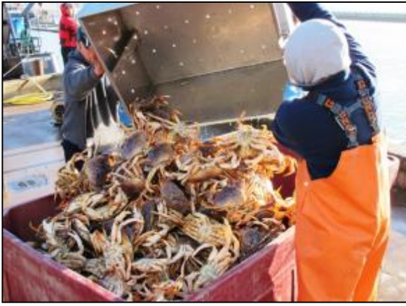
Workers unload catch from a commercial crabber.