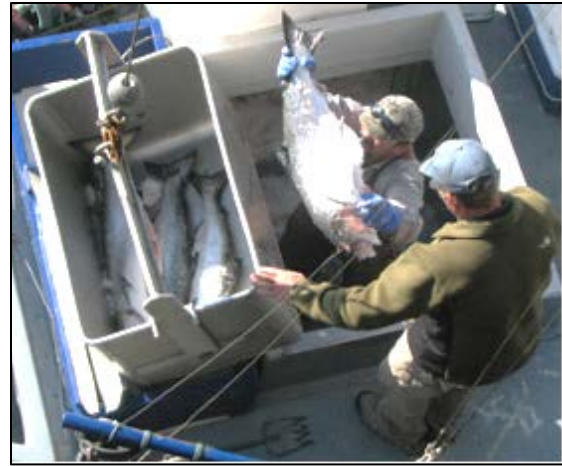
Commercial salmon fishers unload a chinook salmon at the docks.

Contact: Cyreis Schmitt, 541-867-0300 ext. 265 ( Cyreis.C.Schmitt@state.or.us )