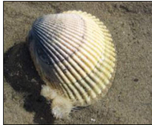
Heart cockles are an important part of Oregon's bay clam fishery.

Contact: Scott Malvitch, 541-867-0300 ext. 234 ( scott.malvitch@state.or.us )