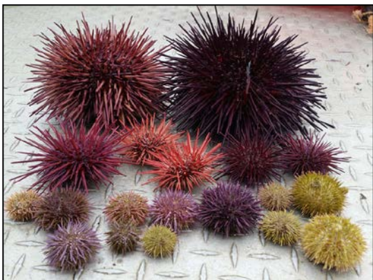
Sea urchins from recent survey work.

Contact: Eric Schindler, 541-867-0300 ext. 252 ( Eric.D.Schindler@state.or.us )