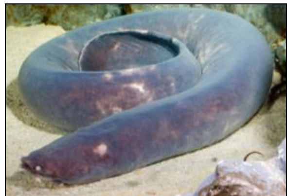
Most hagfish are exported to Korea.