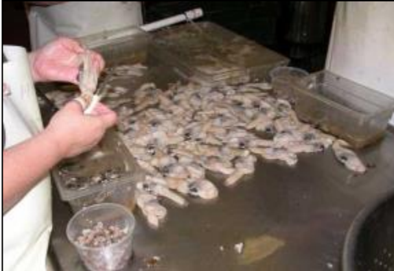
A worker cleans a commercial catch of razor clams.

Contact: Mitch Vance, 541-867-0300 ext. 233 ( Mitch.Vance@state.or.us )