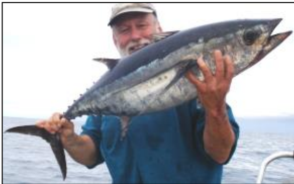
Albacore tuna appear off the Oregon coast from July to October.