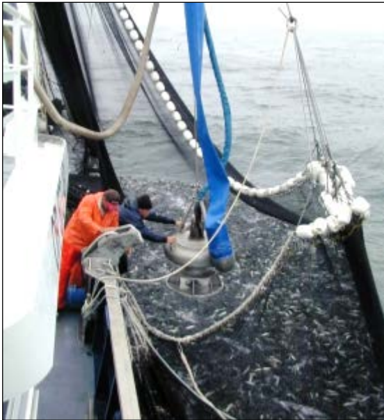
Fishers prepare to suck sardines from a seine net into the hold.