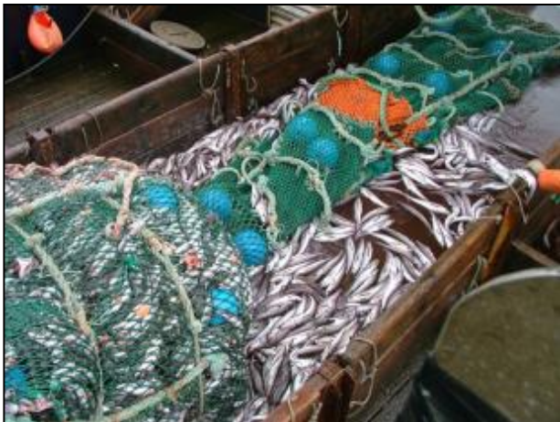
A good catch of Pacific whiting hits the deck.

Contact: Brett Rodomsky, 541-867-0300 ext. 291 ( Brett.T.Rodomsky@state.or.us )