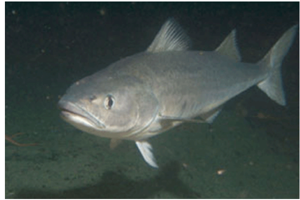
Black cod or sablefish is the primary species targeted by the fixed gear fishery.

Contact: Patrick Mirick, 541-867-0300 ext. 229 ( Patrick.P.Mirick@state.or.us )