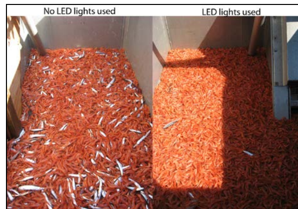
A divided shrimp hopper where LEDs were not used and used, note the difference in bycatch of eulachon smelt (the silvery fish).

Contact: Kelly Corbett, 541-867-0300 ext. 244 Kelly.C.Corbett@state.or.us