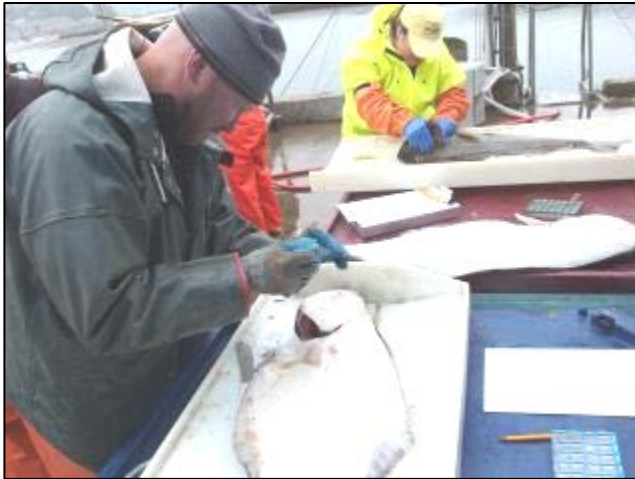
A biologist measures a commercially-caught halibut.

Contact: Troy Buell, 541-867-0300 ext. 225 ( Troy.V.Buell@state.or.us )