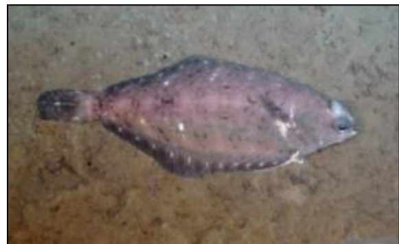
Dover sole is a commonly-caught trawl species.

Contact: Cyreis Schmitt, 541-867-0300 ext. 265 ( Cyreis.C.Schmitt@state.or.us )