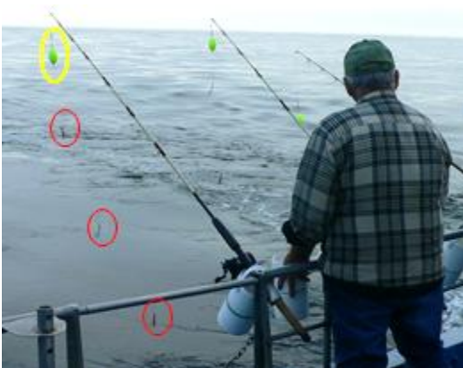
Photo of long-leader gear