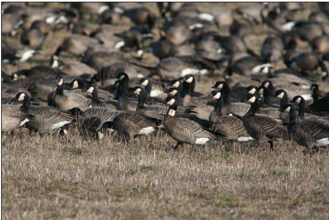
Figure 128: Cackling goose with faded yellow neck collar.