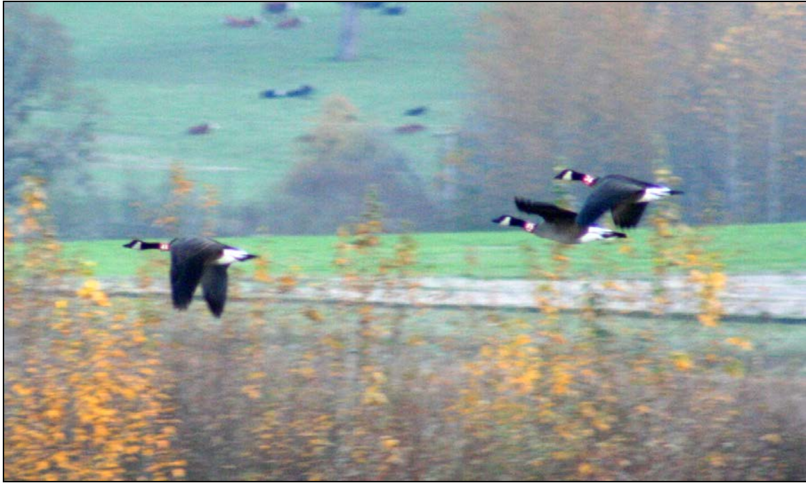
Figure 121: Dusky with typical red neck collars.