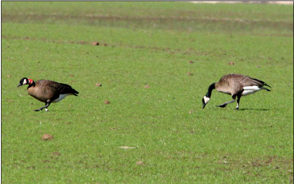
Figure 122: Dusky with a red neck collar.