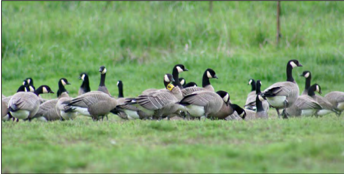
Figure 123: Cackler with yellow neck collar.