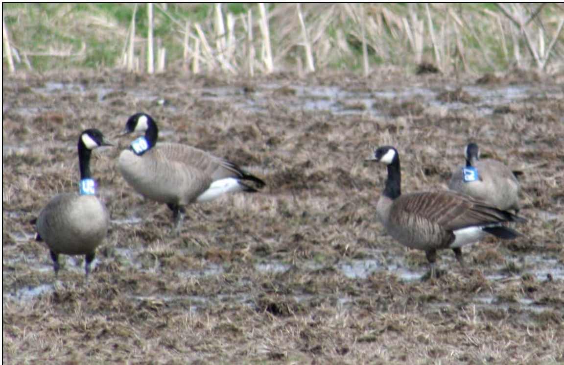
Figure 126: Lessers with blue neck collars.