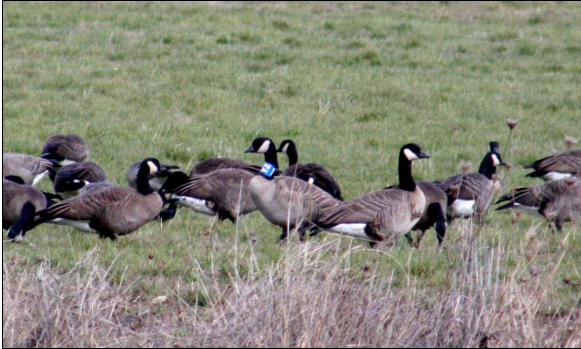
Figure 125: Lesser with blue neck collar.