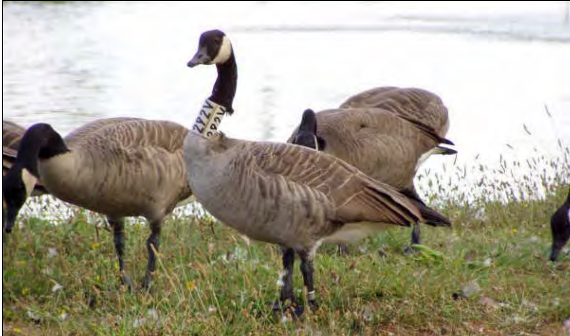
Figure 127: A western with a white neck collar.